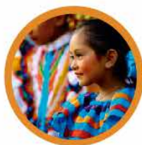
Culture & Engagement

The LAA achieves its mission through five focus areas :